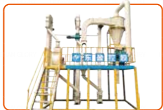
Kernel & Shell Separator 仁壳分离机