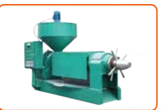
Palm Kernel Oil Press 棕榈仁榨油机