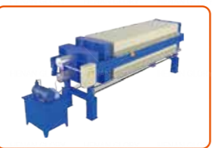
Plate Filter Press 板框压滤机