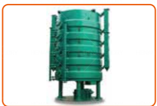
Steam Roaster 蒸汽炒锅