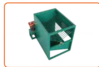
Small Thresher 小型脱果机