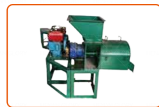
Single Screw Palm Oil Press/单螺旋榨油机