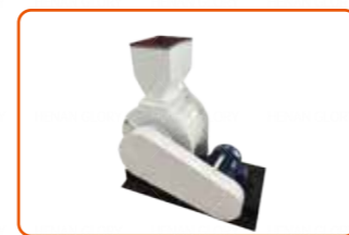
Palm Nut Cracker 棕榈仁剥壳机