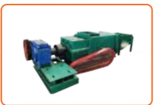
Double Screw Palm Oil Press/双螺旋榨油机